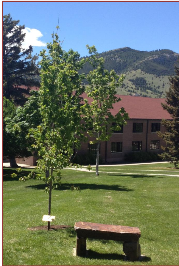
Tatarian Maple "Hot Wings" and Stone Bench. Looking southwest to Mount Helena.